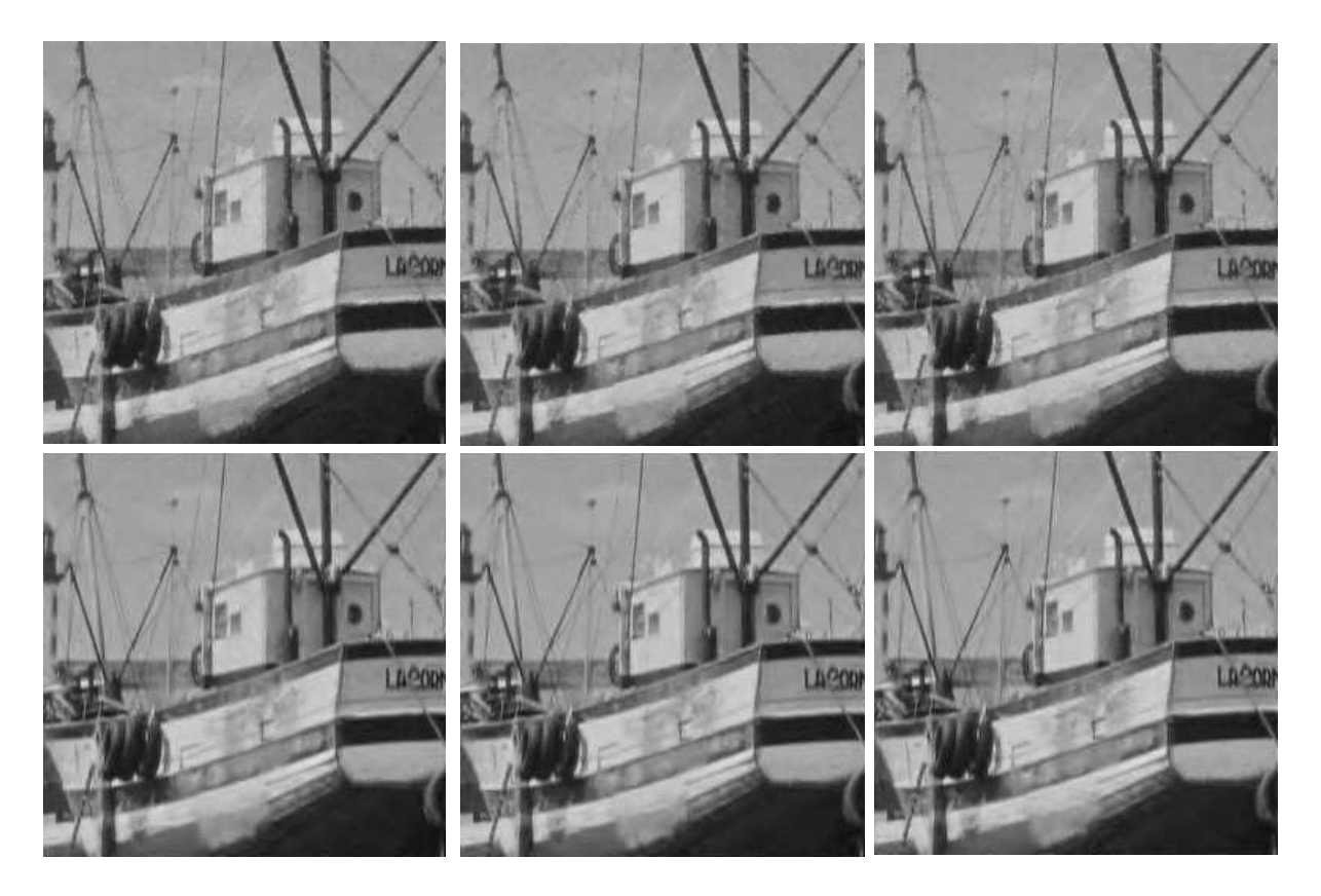
Fig. 2. Reconstructed 256 \times 256 Boats with M = 20,000 samples. First row: min-TV reconstruction [11]. Second Row: Iterative thresholding reconstruction [14]. In each row, left: results of the dense SFE and ideal random permutation; middle: results of the SBHE with B = 32 and an LCP scrambler; right: results of the SBHE with B = 32 and an RPRI scrambler;