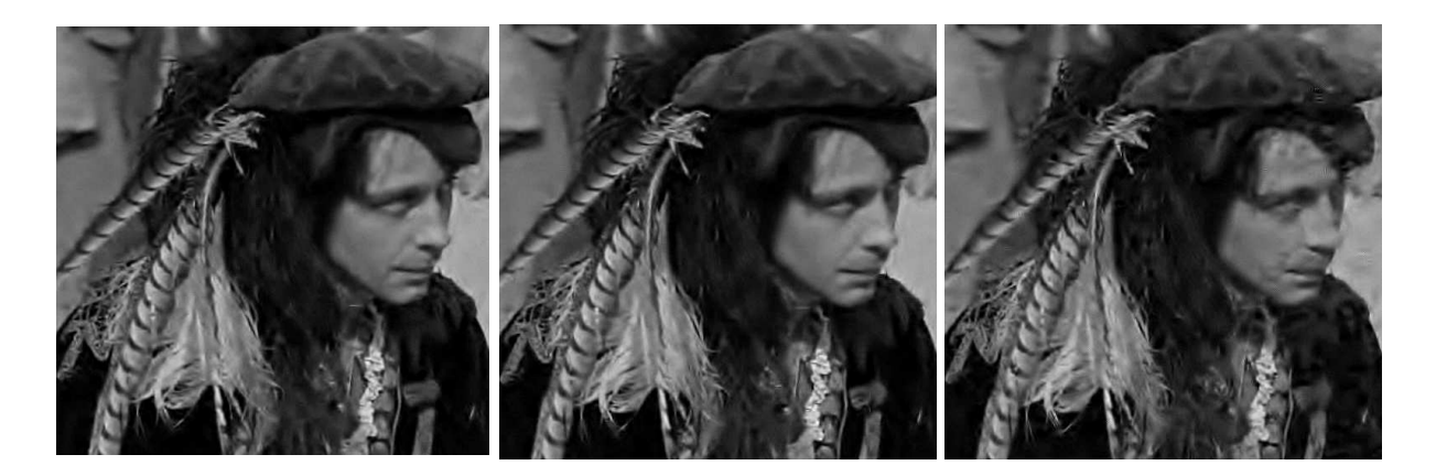
Fig. 3 . Portions of reconstructed 1024 \times 1024 image Man using iterative thresholding. Left: SFE with ideal random permutation, PSNR=27.6dB; Middle: SBHE with B = 32 and LCP scrambler, PSNR=27.8dB; SBHE B = 32 and RPRI crambler: PSNR=26.5dB.